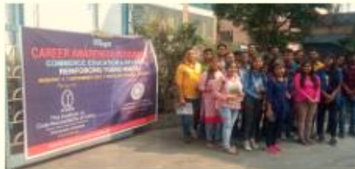
Our students participate in Career-Awareness Programs