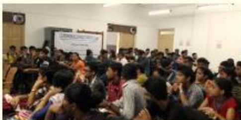
Our students participate in Career-Counselling Seminars